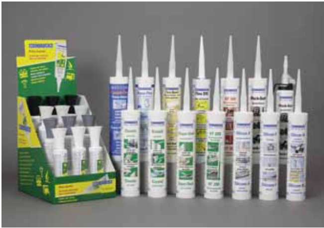
Elastic Adhesives and Sealants flexible - strong - durable