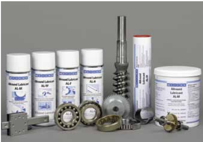
Allround Lubricant High performance greases lubricating - separating - protecting