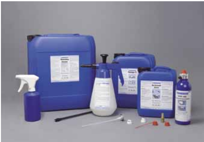
Technical Liquids environmentally-friendly - economical - effective