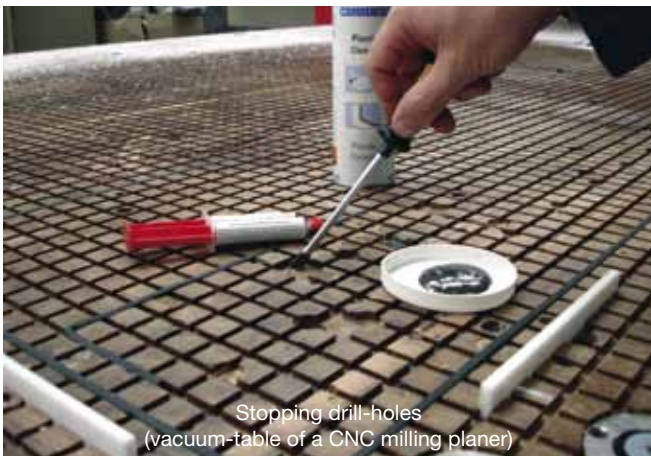
Stopping drill-holes (vacuum-table of a CNC milling planer)