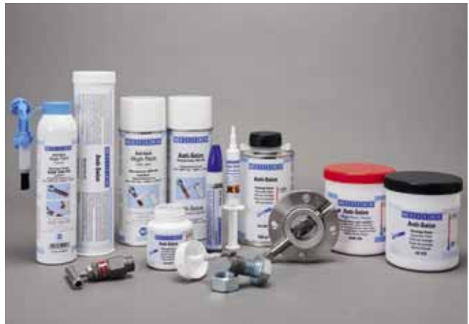
Anti-Seize Reliable protection against corrosion, seizure and wear.