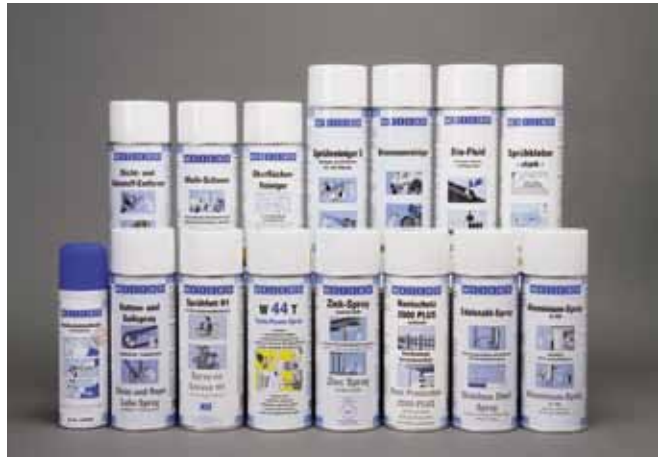
Technical Sprays For metal protection, cleaning, lubrication, rust loosening, etc.