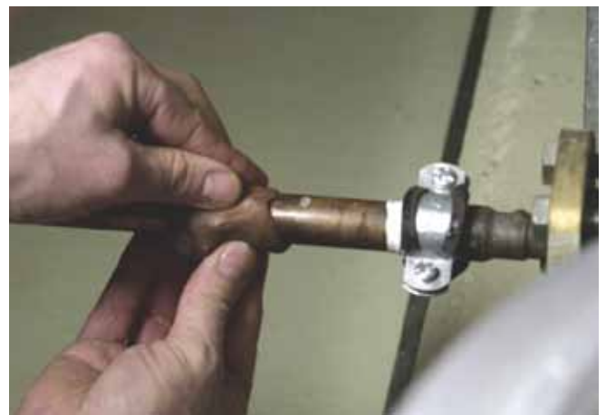
Sealing of a copper tube